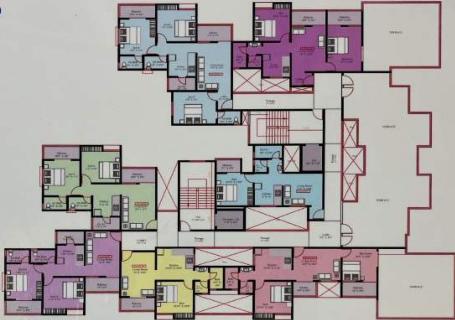
7th Floor Plan