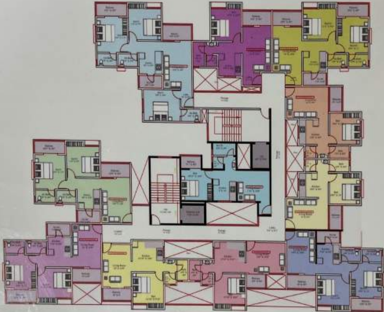
3rd, 4th, 5th, 6th Floor Plan