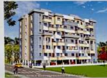
Venkatesh Residency (Pune-Hadapsar)