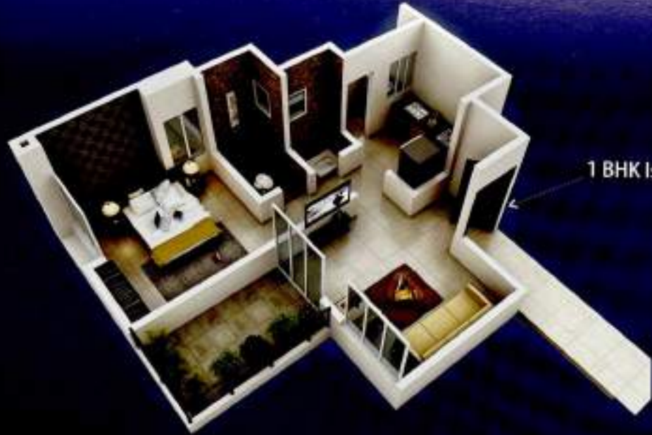
1 BHK Isometric View