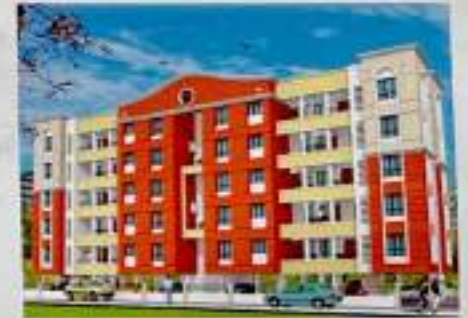
Venkatesh Terrace (Pune-Kharadi)

Venkatesh Nandanvan Luxurious 1, 2 BHK Apartments & Shops