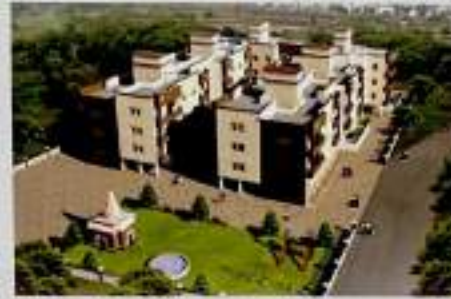
Venkatesh Swapna Nagari Phase - I, (Saswad)