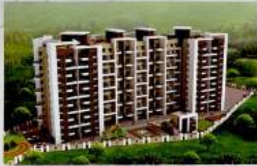
Venkatesh Paradise (Pisoli, Pune)