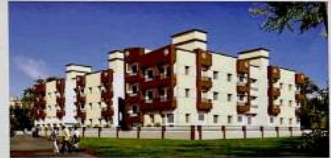
Venkatesh Swapna Nagari Phase - II, (Saswad)