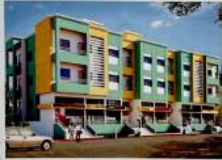
Venkatesh Orchid (Saswad)